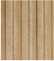
GOLDEN OAK - MCB320G