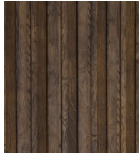
ANTIQUE OAK - MCB320A