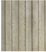
SMOKED OAK - MCB320D