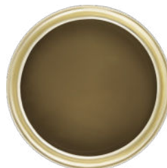
Antique Oak 500ml AP500A MILCOATAO

↑ Colour tone may vary from batch to batch. Antique Oak has more variance between boards.