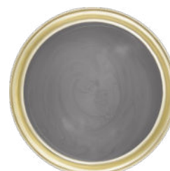
Brushed Basalt 500ml AP500B MILCOATBB