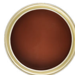
Jarrah 500ml AP500J MILCOATJA