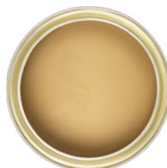
Golden Oak 500ml AP500G MILCOATGO