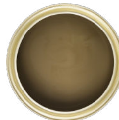
Vintage 500ml AP500V MILCOATVI