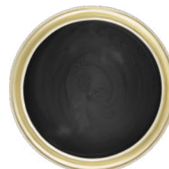
Burnt Cedar/Embered 500ml AP500R MILCOATBC