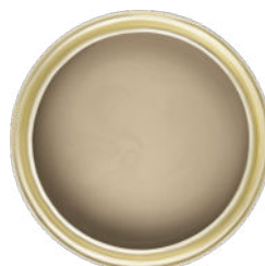
Limed Oak 500ml AP500L MILCOATLO