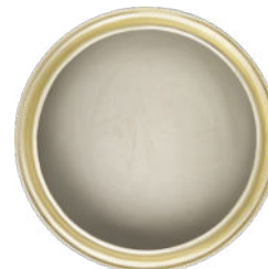
Smoked Oak/Driftwood 500ml AP500D MILCOATSO