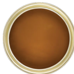
Coppered Oak 500ml AP500C MILCOATCO