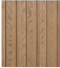
GOLDEN OAK - MCB360G