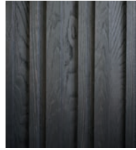
BURNT CEDAR - MCB360R