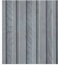
SMOKED OAK - MCB360D